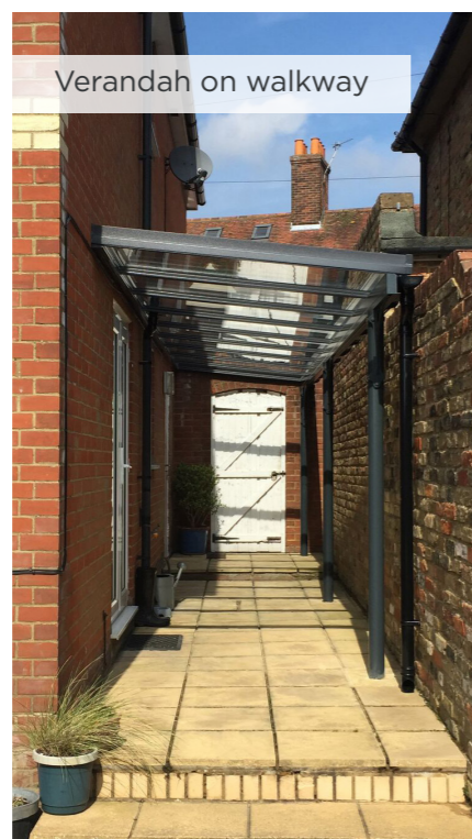
Verandah on walkway